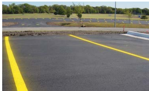
High Park Parking Lot

open shelter and playground was paved. The parking lot was extended and striped,